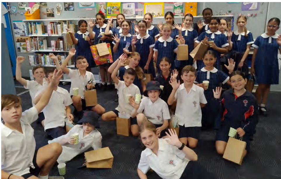
LIBRARY MONITORS 2023 AT THEIR END OF YEAR CELEBRATION